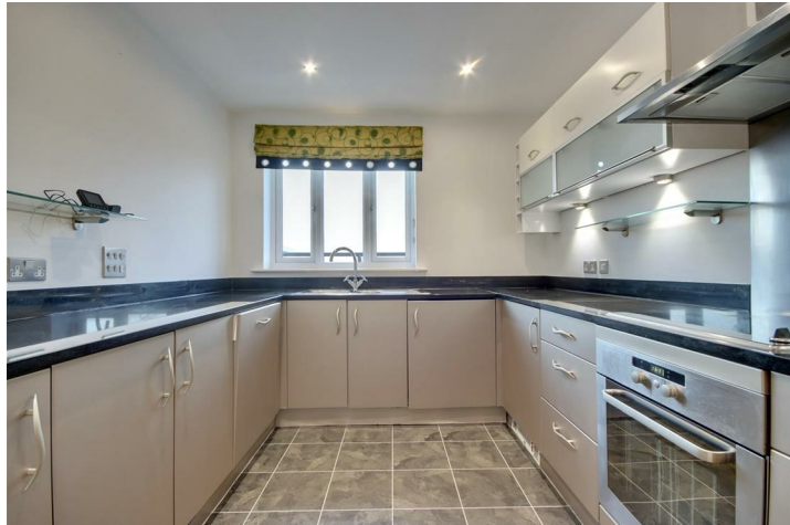
4TH FLOOR 908 sq.ft. (84.4 sq.m.) approx.